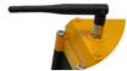
RX Antenna Incl.