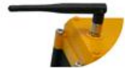
RX Antenna Incl.